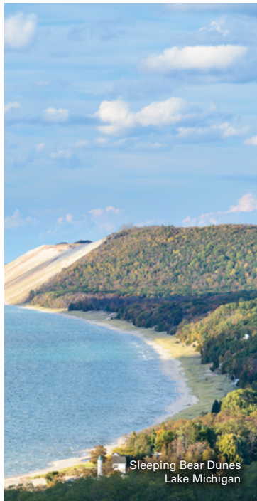
Sleeping Bear Dunes Lake Michigan