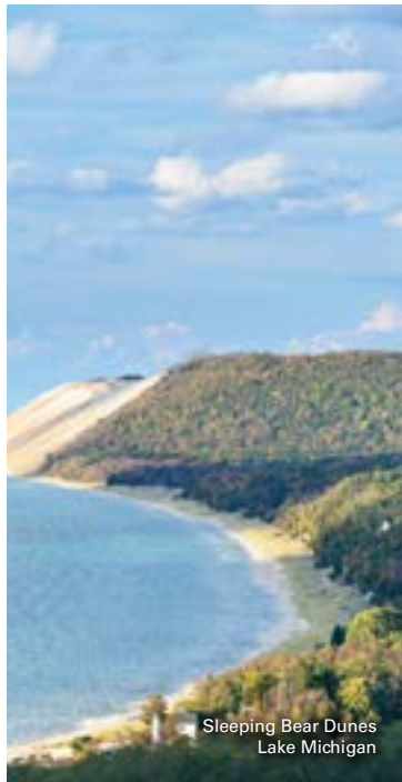
Sleeping Bear Dunes Lake Michigan